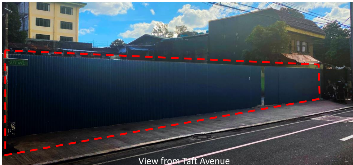
View from Taft Avenue