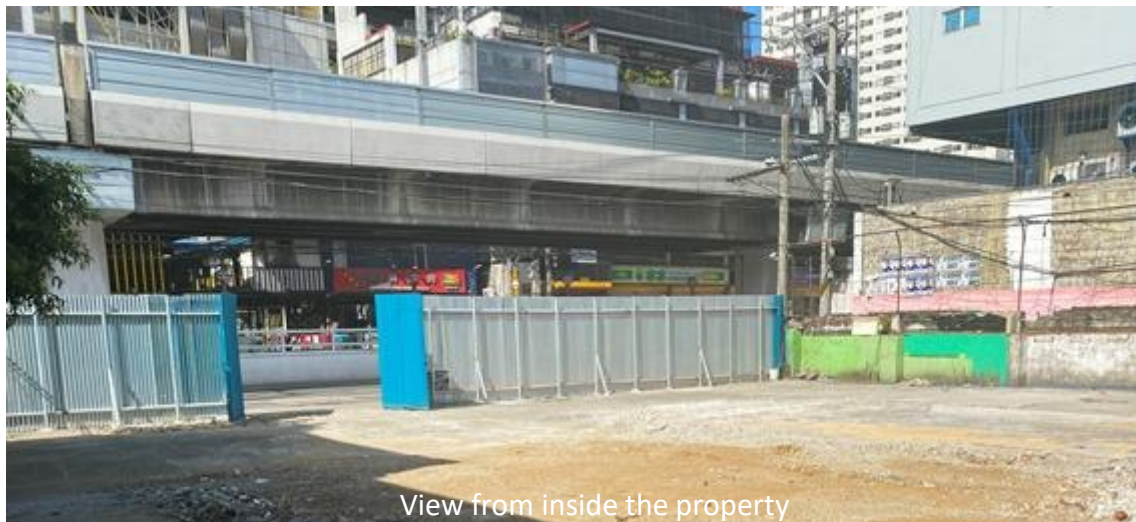
View from inside the property